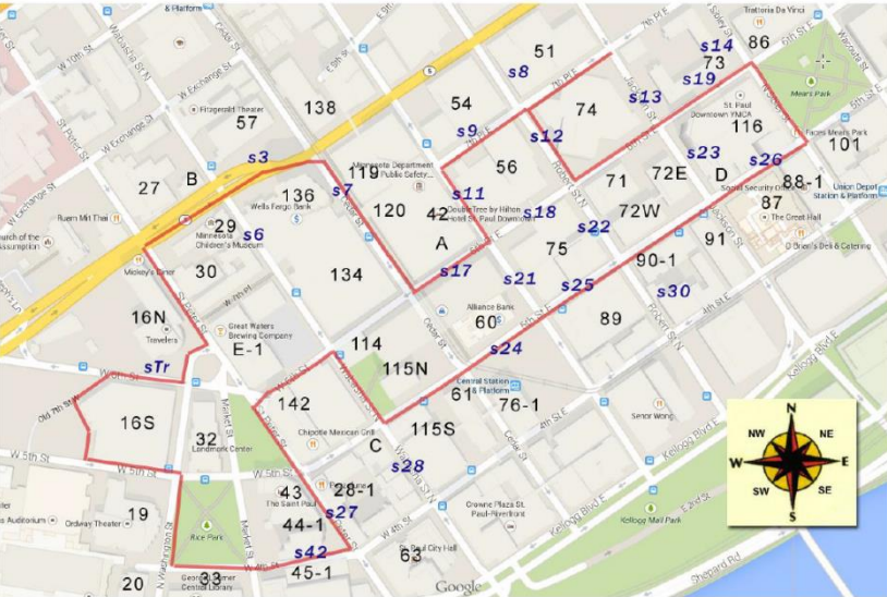
Project BirdSafe – St Paul Route Map Updated: March 2015